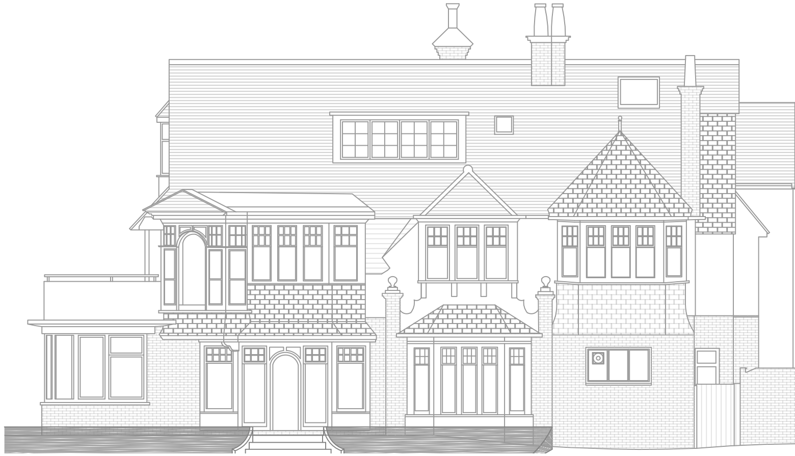
Existing East Elevation (Scale 1:100)