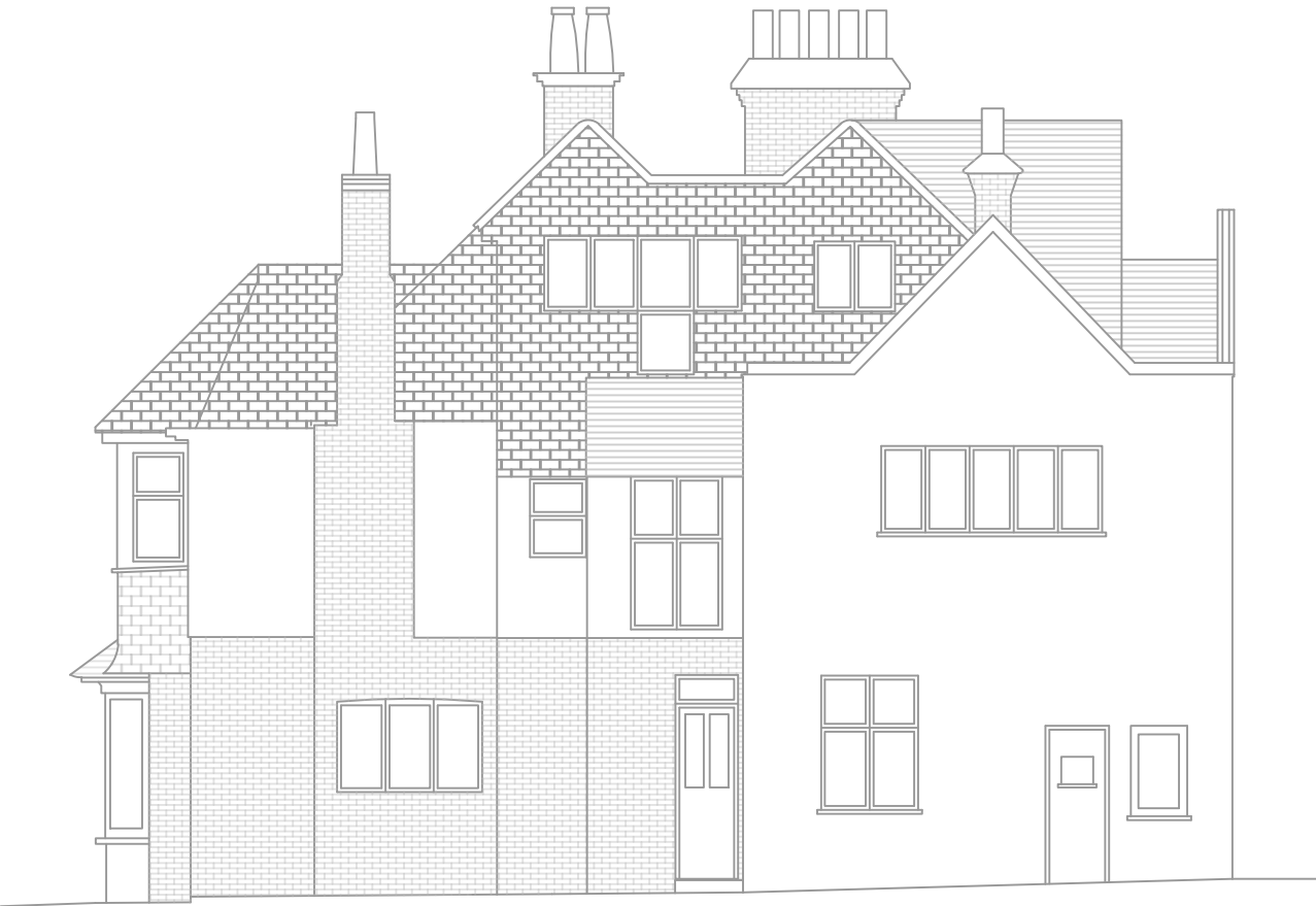
Existing North Elevation (Scale 1:100)